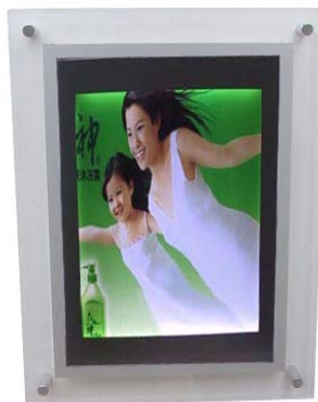
On the wall