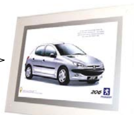
Place image on front board