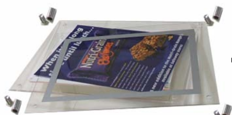
Unscrew the bolts and remove the board