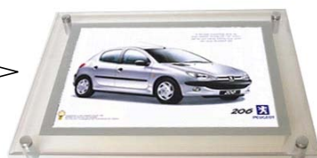
Add the front board and screw bolts